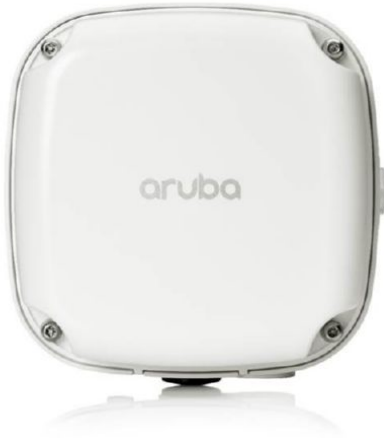
Aruba 560EX Series Hazardous Location Access Points

The Aruba advanced ClientMatch technology and an integrated Bluetooth beacon can help enable Aruba location services.